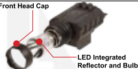
LED Integrated Reflector and Bulb