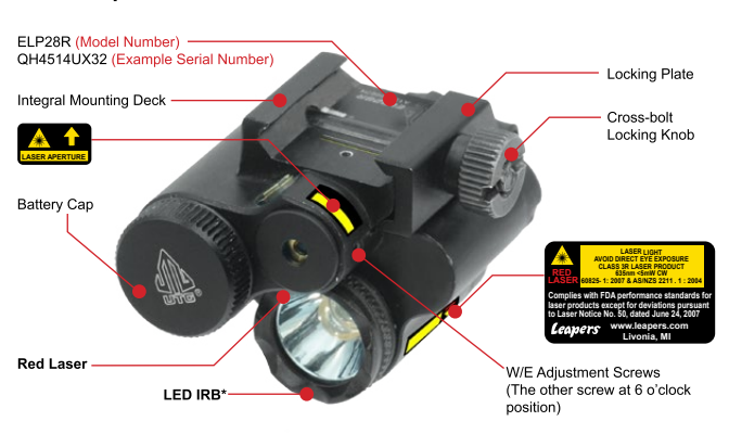
*IRB - Integrated Reflector and Bulb