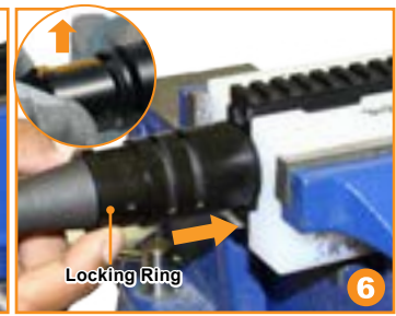
Slide the Locking Ring into the Barrel Nut, making sure the alignment slot on the Locking Ring is vertical and facing upward.

Use the Barrel Nut Wrench to securely tighten the Barrel Nut with enough tension (35 ft-lb). (We recommend using a torque wrench to achieve proper tension).